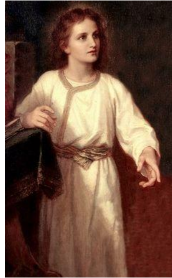
Jesus among the Doctors, by Heinrich Hofmann

In Canticle of Canticles, King Solomon, David's son, is described as white and ruddy: