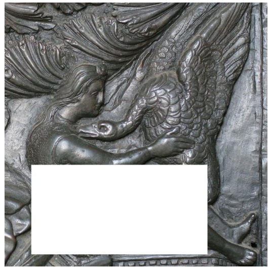
Zeus raping Leda

For example, the main door to the Vatican contains several images of false gods and immorality. The door was erected in 1445 by order of apostate Antipope Eugene IV. It is named the Filarete Doors after the apostate artist. Here are some of the images: