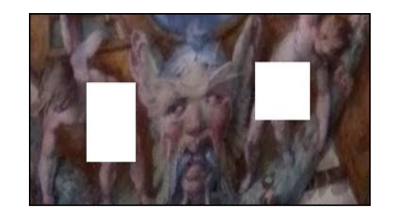
Demonic face and naked putti

These images reflect the four primary crimes of the Great Apostasy: