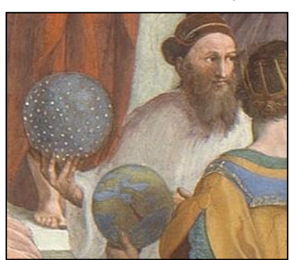
Detail of Zoroaster

Here are images in Vatican City in The Gallery of Maps. As the name implies, this gallery is frescoed with maps commissioned by Apostate Antipope Gregory XIII in 1580.