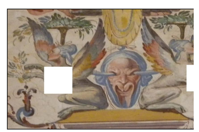
Greek sphinxes baring their breasts next to a devil face

Here are images in Vatican City in The Gallery of Maps. As the name implies, this gallery is frescoed with maps commissioned by Apostate Antipope Gregory XIII in 1580.