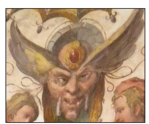
Demonic face with wings