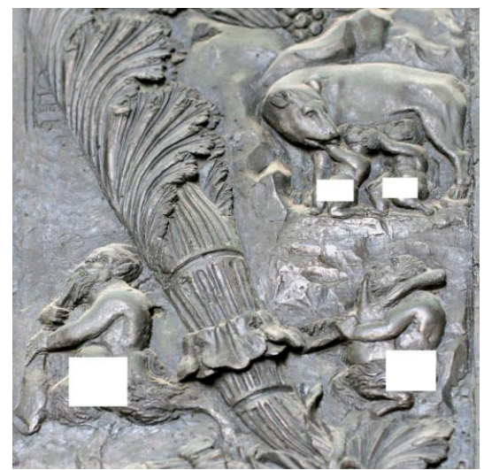
Romulus and Remus suckled by the wolf, and two satyrs playing pipes