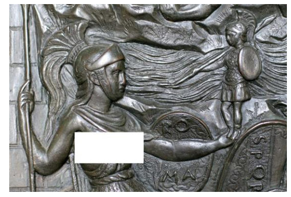
Detail of the false goddess Roma holding a statue of Mars