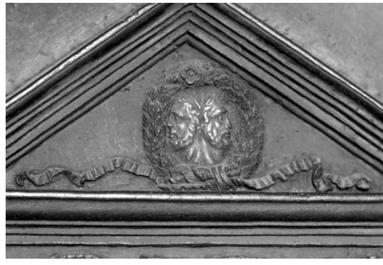
Detail of Janus with two faces