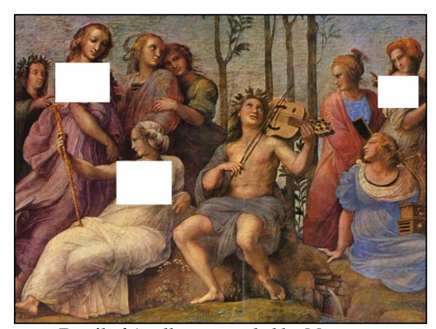
Detail of Apollo surrounded by Muses