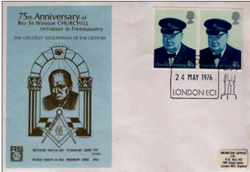
An English postcard featuring Winston Churchill surrounded by Masonic symbols. The card reads: 75th Anniversary of Bro. Sir Winston CHURCHILL initiation in Freemasonry. THE GREATEST ENGLISHMAN OF THE CENTURY, 24 May 1976.