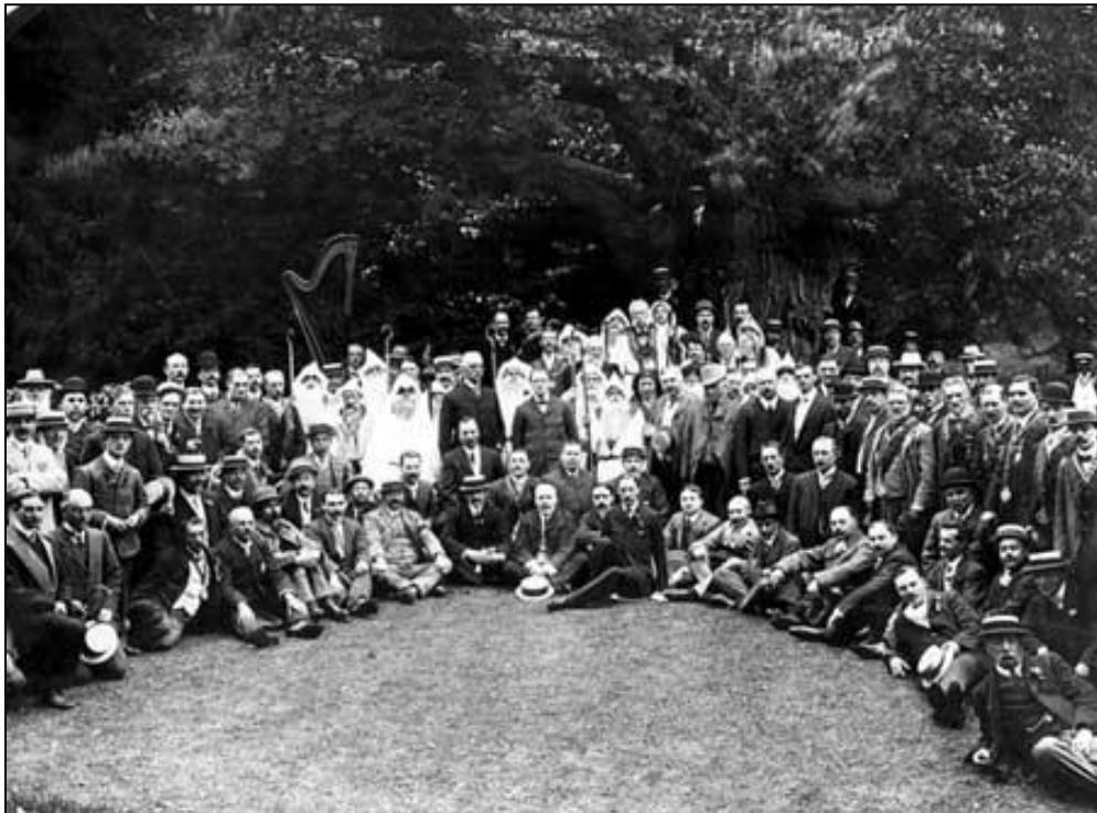
Distance view of the above photograph of Winston Churchill’s Druid Initiation, 1908