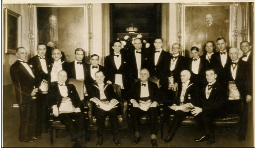
Distance view of the above photograph of Franklin Roosevelt at a Masonic Lodge meeting, 1935

The main leaders of the Axis powers were professed Catholics, anti-Communists, anti-Masons, anti-Talmudic and Zionist Jews, and anti-democracy: Adolf Hitler in Germany, Benito Mussolini in Italy, Marshall Pétain in France, and Generalissimo Francisco Franco in Spain; whereas, those they fought against were professed enemies of the Catholic Church.