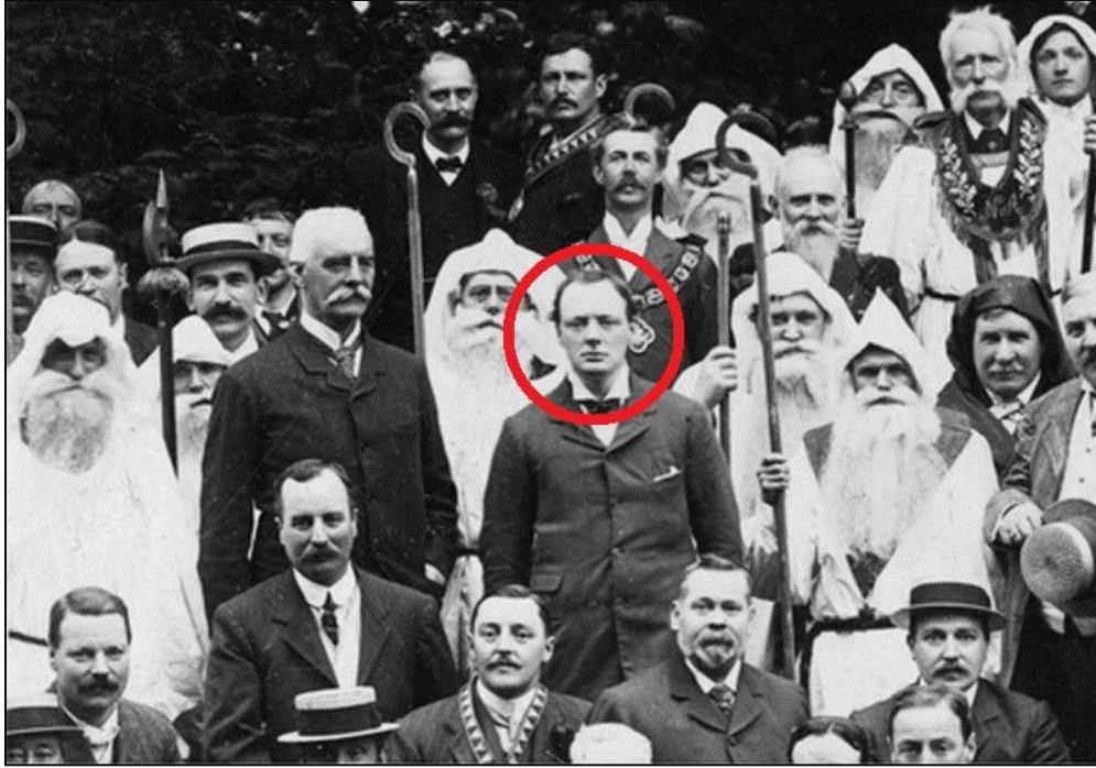
“Winston Churchill [circled] being installed into the Albion Lodge of the Ancient Order of Druids at Blenheim Palace, 15 August 1908” 23