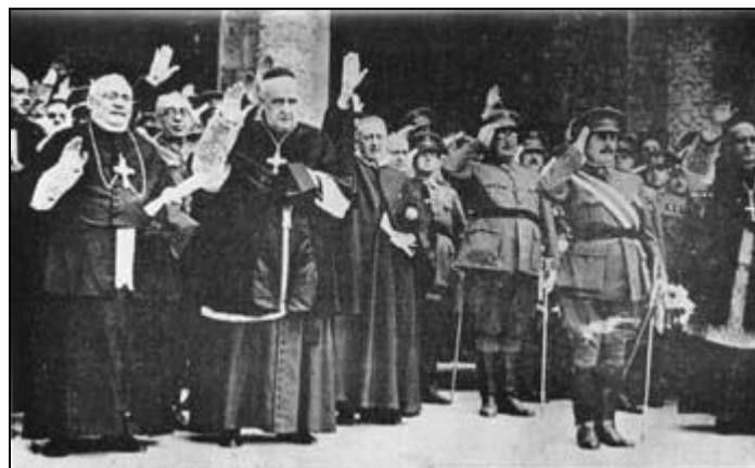
The Spanish [Apostate] Catholic hierarchy giving the Fascist salute at Santiago de Compostela in 1937