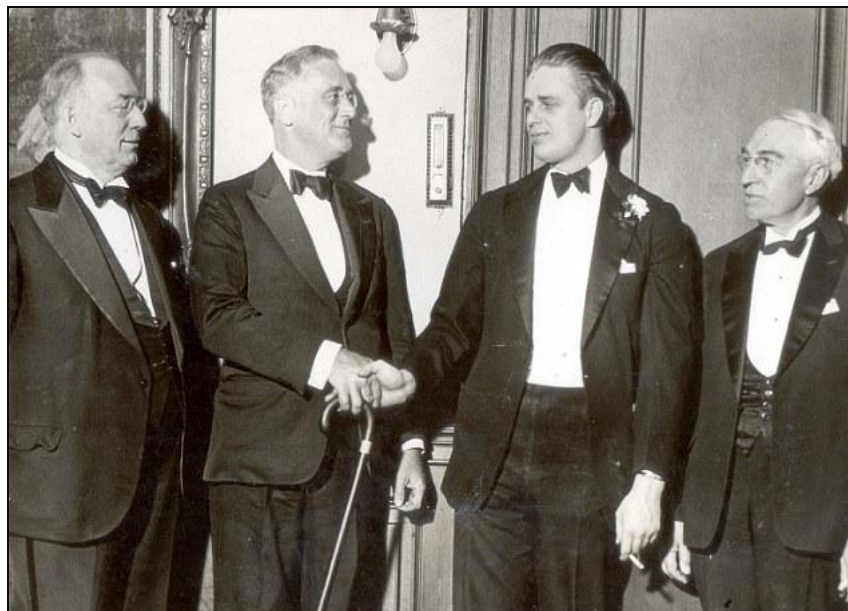
Franklin Roosevelt gives his son Elliot a masonic handshake during his induction into Freemasonry, 1933