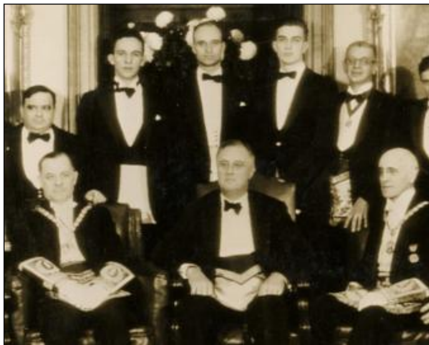
Franklin Roosevelt at a Masonic Lodge meeting, 11/7/1935