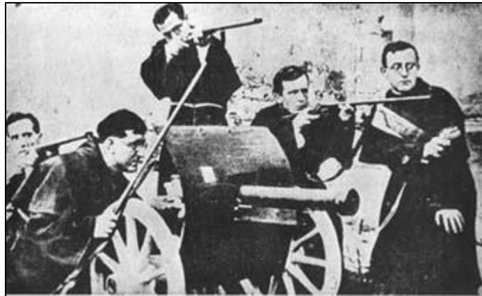
Catholic monks fighting alongside Franco against the Jew-led Marxists during the Spanish Civil War

“After the victory of the Spanish ‘Fascists’, on June 11, 1939, 3,000 Spanish legionnaires were received at the Vatican by [Apostate Anti-] Pope Pius XII. The Pope welcomed them warmly...” 6