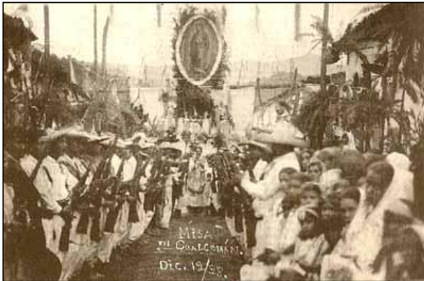
Cristeros with a banner of Our Lady of Guadalupe, 12/12/1928

"The [French] Revolution is still with us. The issues may have changed but the spirit is the same, and it has now permeated the entire world. Behind all this, of course, stands a spiritual power I will make no bones about naming, no matter how old-fashioned it may sound: this is the devil in his eon-old struggle against God. He knows that his time is running short; he is intensifying his efforts and, being intelligent, realizes that his most likely cooperators are to be sought among those who crucified Christ. This he has done throughout the centuries and more particularly since the 18th century, until such time as the Mystery of Iniquity will find its completion in the earthly kingdom of the Jews under Anti-Christ. Many private prophecies say so, and not a few Doctors of the Church have thought so." (pp. 52-53)